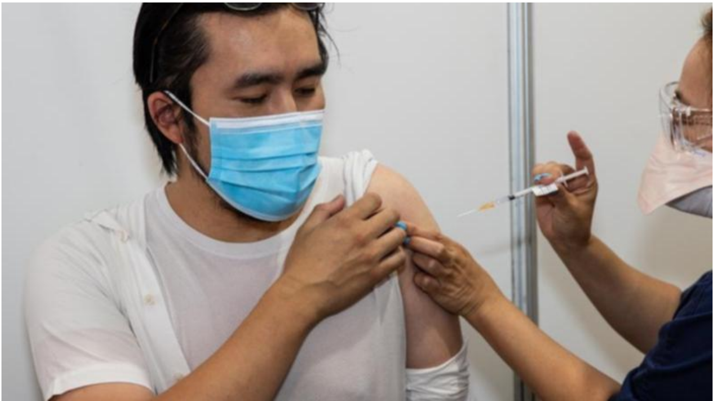
📷 UWA researchers will investigate the impact that COVID vaccine mandates had during the height of the pandemic through a large-scale project believed to be the first of its kind.